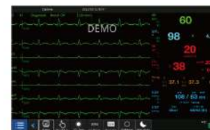
ECG Full Screen