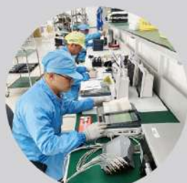
Strict Quality Control